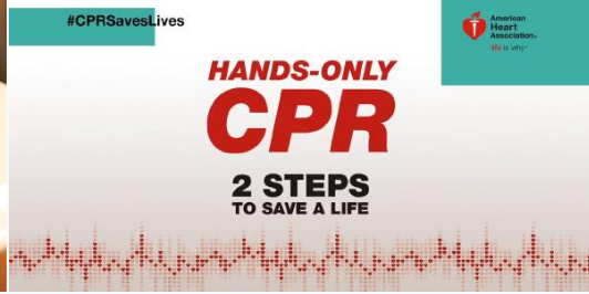
Watch Hands-Only CPR Training