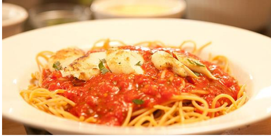
Chunky Marinara with Pasta